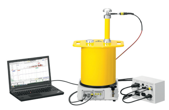
Figure: PD-TaD 62 with laptop and Power Box